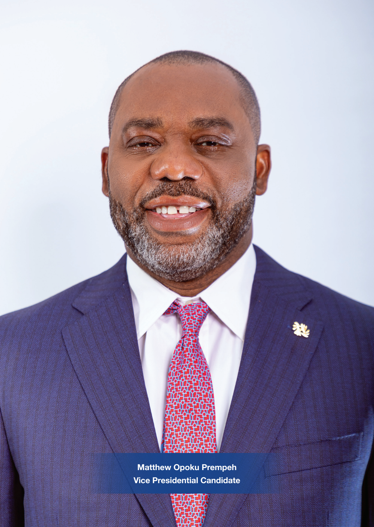
Matthew Opoku Prempeh Vice Presidential Candidate